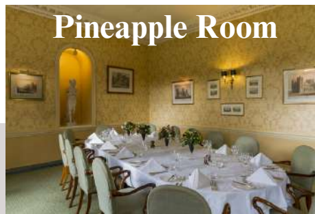
up to 22 People