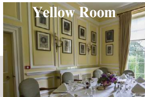
up to 14 People