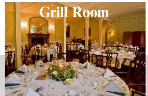
up to 56 People